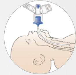
Connect to resuscitation mask or endotracheal tube