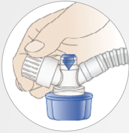
Blue protective cap that can be used to set and check pressures

The Fisher & Paykel Healthcare ergonomic circuit can be connected to the Neopuff™ or other T-Piece resuscitator.* The angled orientation of the PEEP valve has been designed to allow operators to use a more comfortable hand position.